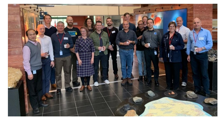
'Effective Seabed Mapping Workflow' workshop participants

between AusSeabed, NOAA, and CCOM, including progressions of the AusSeabed automated processing pipeline. The initial work from this project will be delivered at the AusSeabed workshop, with the development of the pipeline expected to continue into the 19-20 financial year. For more information contact Tyanne.Faulkes@noaa.gov.